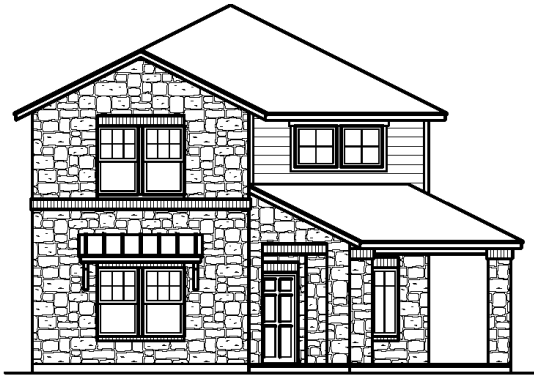
Quadrangle A – Texas Vernacular