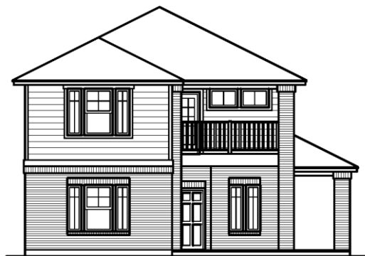
Quadrangle C w/ balcony option