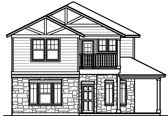
Quadrangle B w/ balcony option