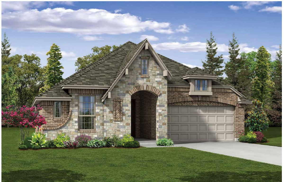
Front Elevation B