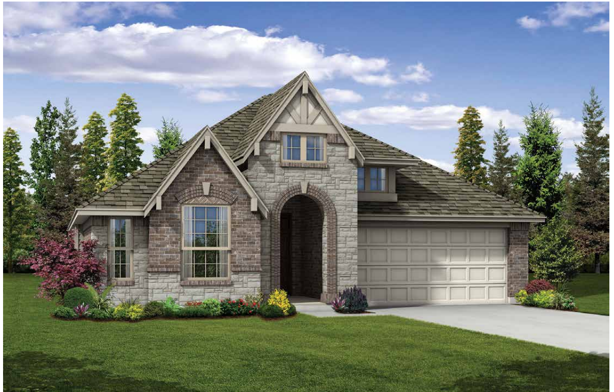
Front Elevation A