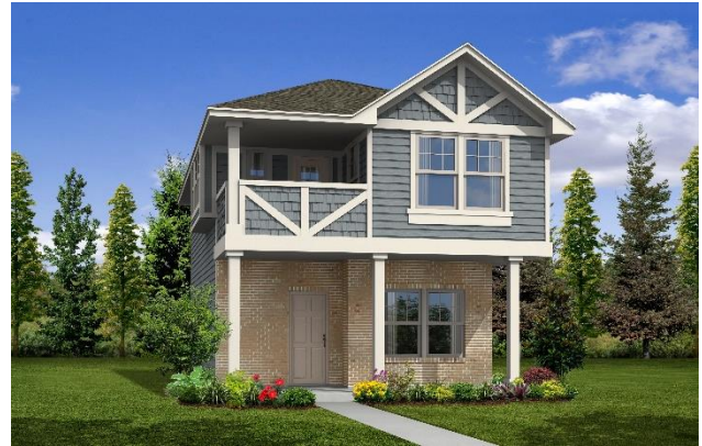
Andrews M w/ optional masonry