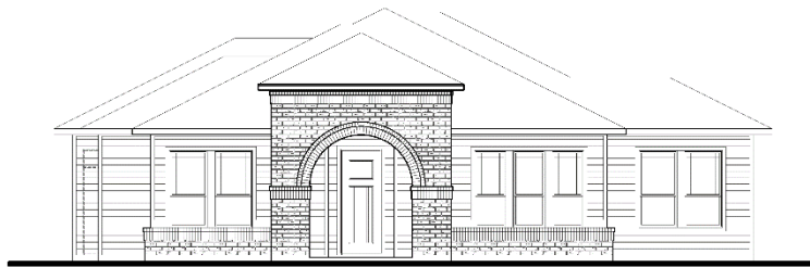
Veranda C – Modern Prairie