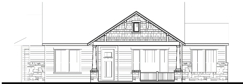
Veranda B - Craftsman