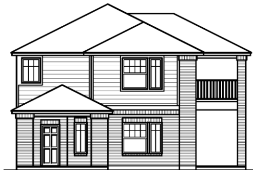
Plaza C – Modern Prairie