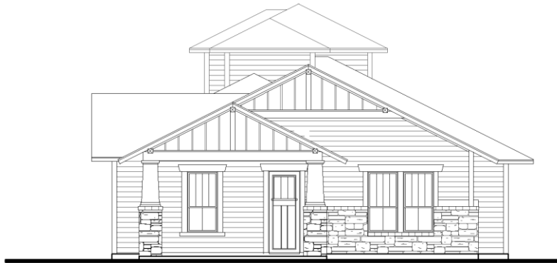
Loggia B - Craftsman