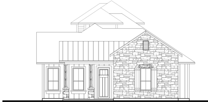
Loggia A – Texas Vernacular