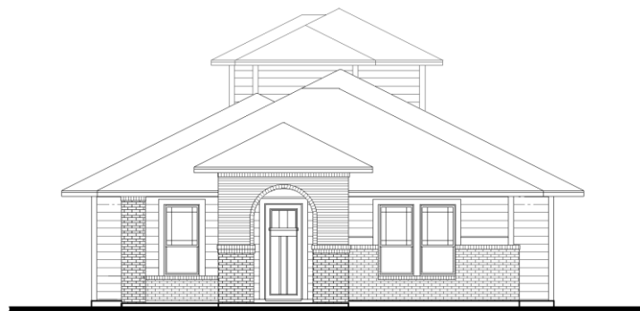
Loggia C – Modern Prairie