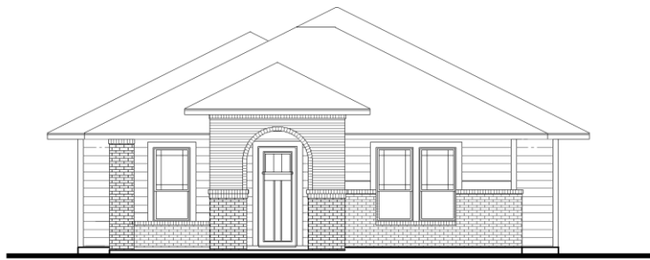
Loggia C – Modern Prairie