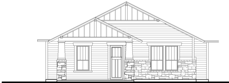
Loggia B - Craftsman