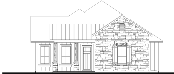
Loggia A – Texas Vernacular