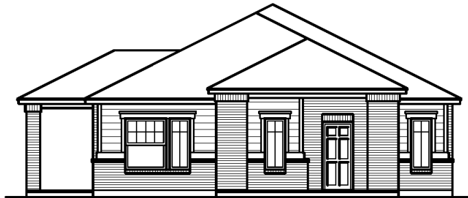
Court C – Modern Prairie