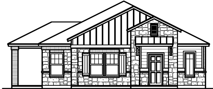
Court A – Texas Vernacular