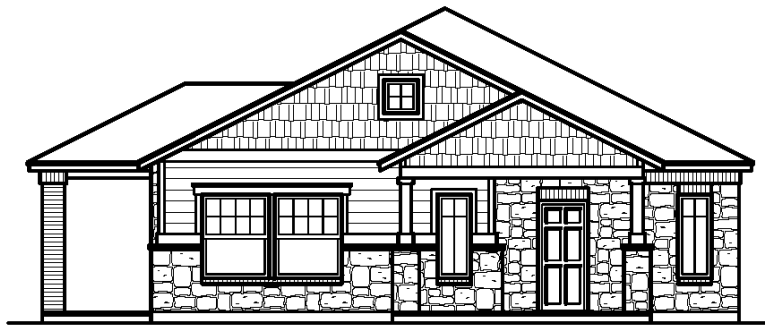
Court B - Craftsman