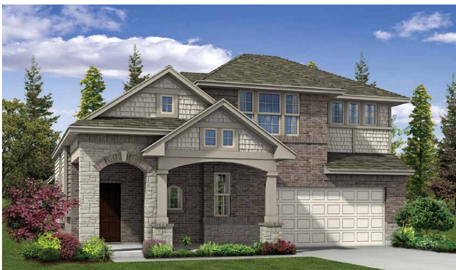
Front Elevation C