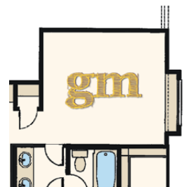
Optional Gameroom @ Bedroom 2