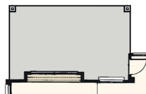
Optional Extended Covered Patio