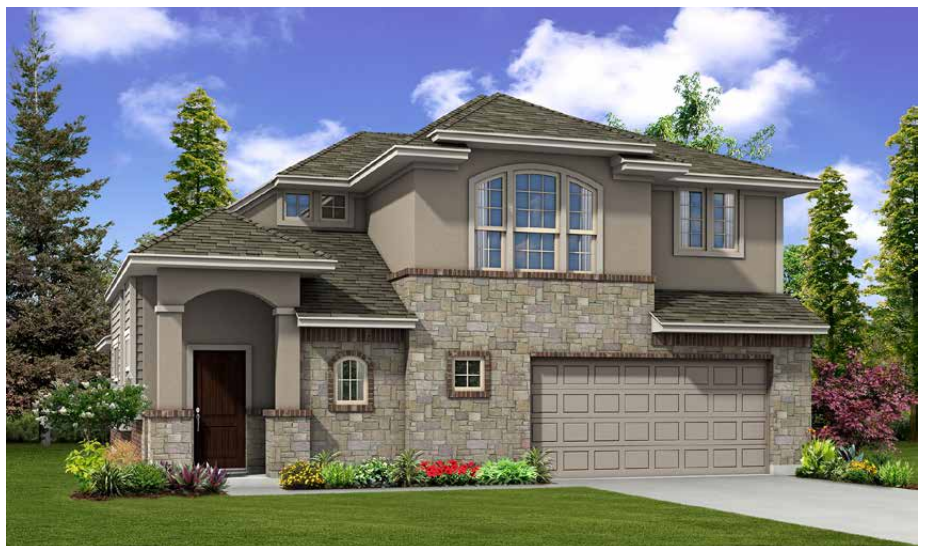
Front Elevation B