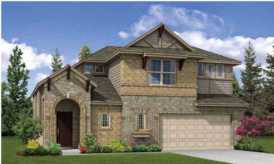
Front Elevation A