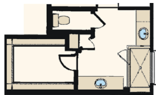
Optional Extended Shower @ Master bath