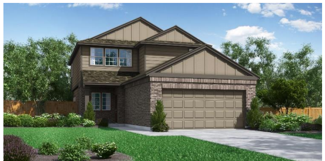
Walker C with optional masonry