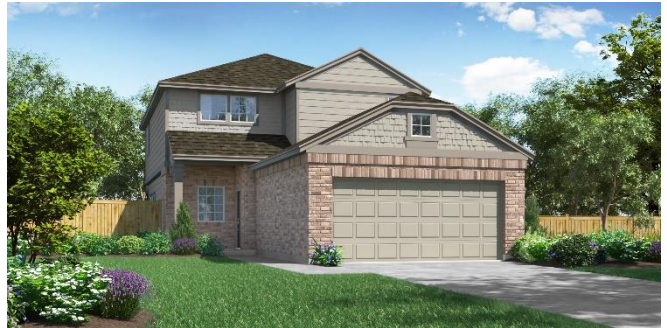
Walker A with optional masonry