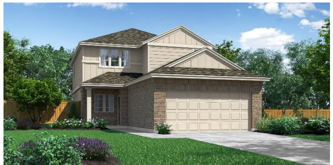
Walker B with optional masonry